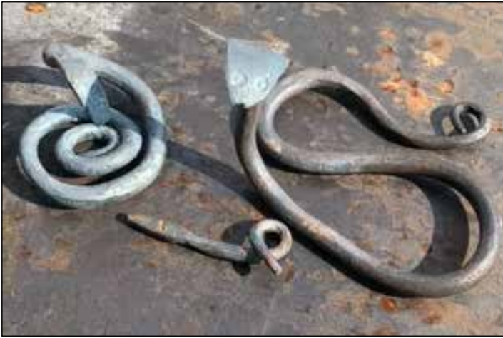
A nest of snakes.