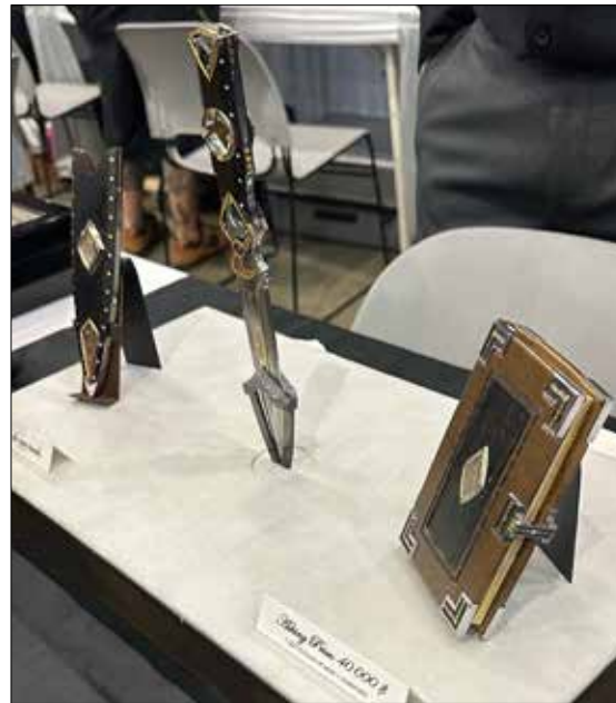
A $40,000 knife set featured at the Atlanta Blade Show

I didn't know that the world's largest blade and knife show is almost in our backyard. Boy was I impressed, and humbled. This was far beyond anything I expected. It seemed that every time I turned around there was yet another jaw dropping example of craftsmanship. Lots of pattern welded Damascus, hand carved handles of all kinds of exotic materials (fossilized mastodon tusk, really?), gold, silver and gem inlays. There were knives and swords that took their makers over a half of a year in actual production time, with prices to match that kind of effort. We're talking about asking prices in the thousands and tens of thousands of dollars. Even still, some makers were sold out before noon on Saturday, proudly displaying a "see you next year" sign.