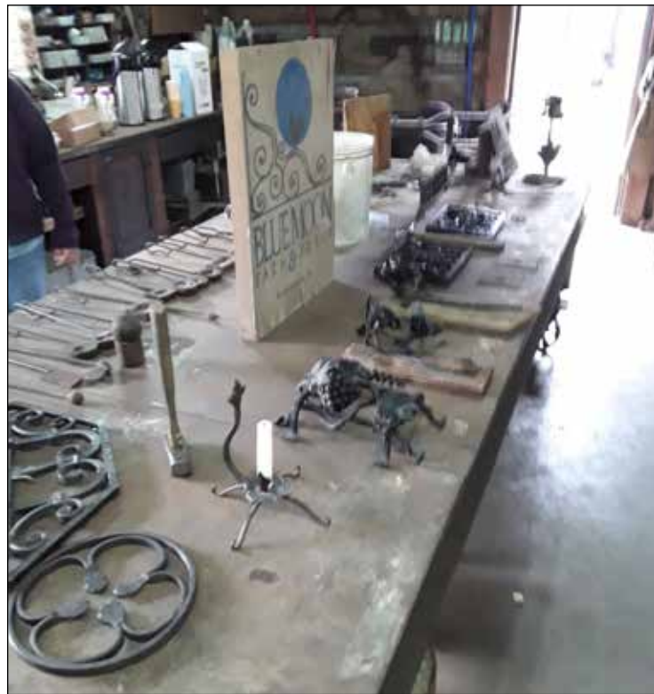
Show and Tell at the Judy Berger Memorial Hammer-In