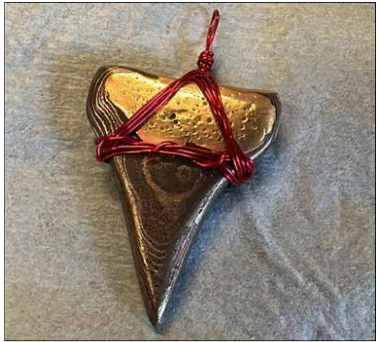
A shark tooth crafted for the FABA Conference Exchange

Timber Creek Distillery is located at 6451 Lake Ella Rd, Crestview, FL 32539. Expect to travel the last leg of your