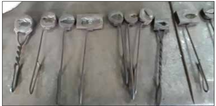
Open face power hammer dies by Clay Spencer