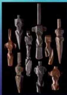
Figurines by Annie Higgins