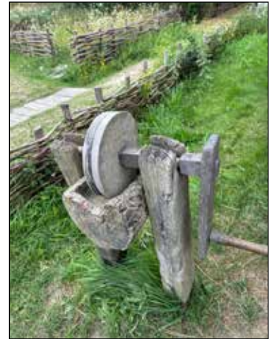
The latest in conveniences are available for your work, like this grinder. All you need is a thrall to power it.

During the last week of our visit, we were scheduled to fly out of Stockholm so we arrived a few days early to take in the city and to visit Birka, on the island of Björkö. In its day (750AD-950AD +/-), Birka was an important Viking Age trading center which handled goods from Scandinavia as well as many parts of the European continent and even as far as from the Orient. Birka is on the UNESCO list of world heritage sites, not just for its archaeological interest but it is also the location of the first Christian congregation in the Nordics. You take a two-hour boat ride to get to the site.