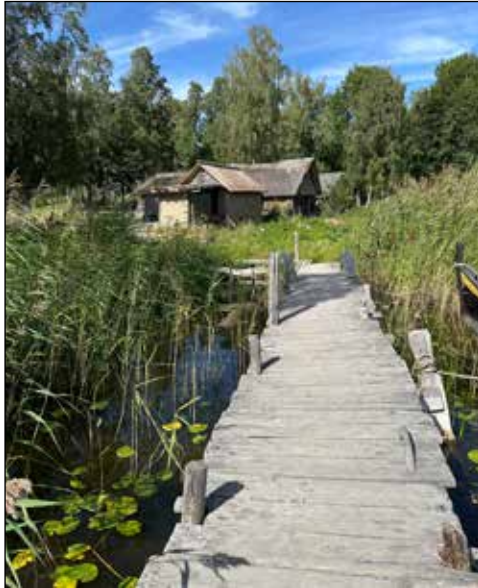
On the dock looking at the reconstructed village.