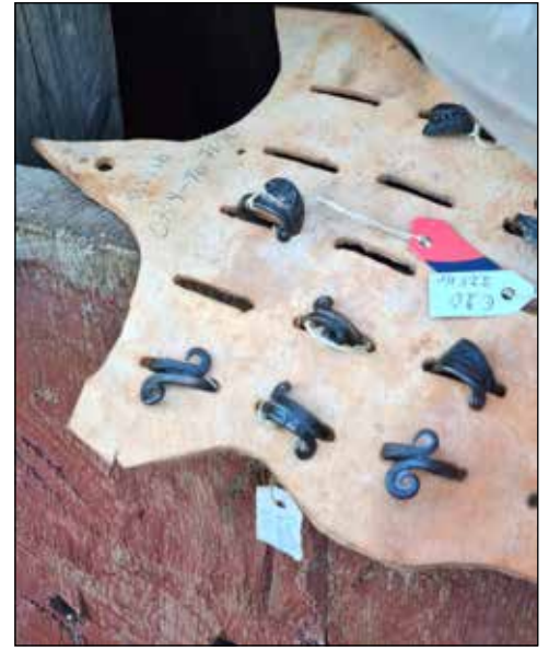
His specialty was iron rings.