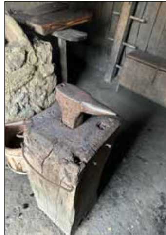
A sad day at the Foteviken Museum, no one there to work the bellows or strike the iron! Who wants to go help them out?

Everyone at the museum village spoke English because the visitors were from all over. The leather crafter I spoke to was spending the weekend in one of the dozen reconstructed houses with his wife and two young boys. When the museum closes to the public he told me you have access to some modern conveniences like the showers and a kitchen. How's that for a road trip?