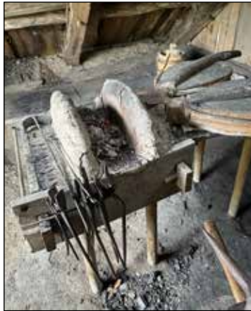
The forge: note the bellows blows air through a hole in the clay firewall, and there is an air gap between the bellows and the back stone.