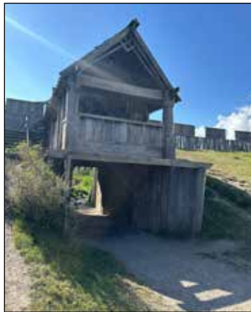
The only remaining (reconstructed) gate at the Trelleborg. Originally there were 4 gates. Each on a cardinal point, standing astride the crossroads for the area.

The next day we visited the Foteviken Museum where I saw another forge, unfortunately there was no smith in residence that day. During casual discussions with the reenactment staff, I found out, that with prior coordination, if you show up in appropriate attire, they will accommodate you in the museum village and let you role play for as long as you want to stay. It helps to know a bit of history as you will get a lot of questions about Viking era blacksmith work.