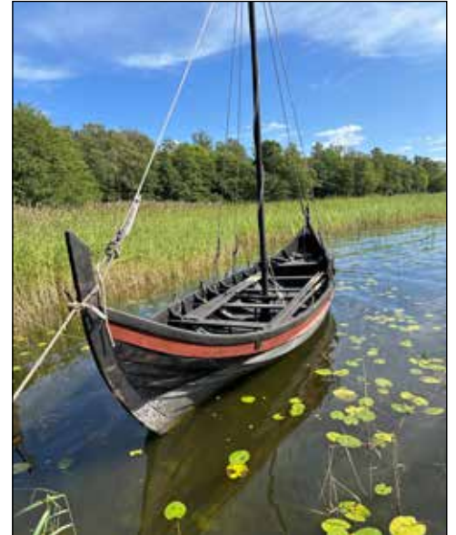
Unfortunately, this was NOT the boat we traveled by to get to the island.

Today it is populated by tourists and a few reenactors.