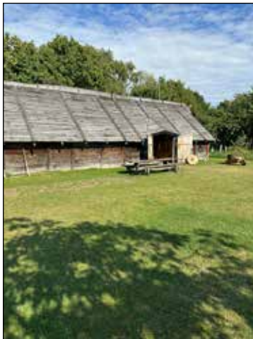
The long house at Trelleborg. Actually, quite nice on the inside with a wood floor covering the areas outside of the fire pit.