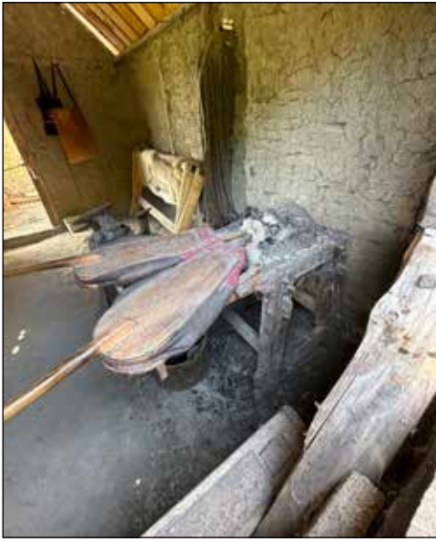
The forge, note how small the fire pot is.