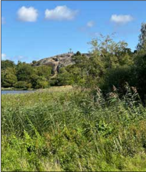
The cross at the top of the hill where the fortress once stood now designates this World Heritage Site's Christian history.