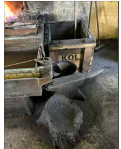
KOL is charcoal. Lars-Gören is a master at managing the fire to get the most out of it with almost no fire scale!