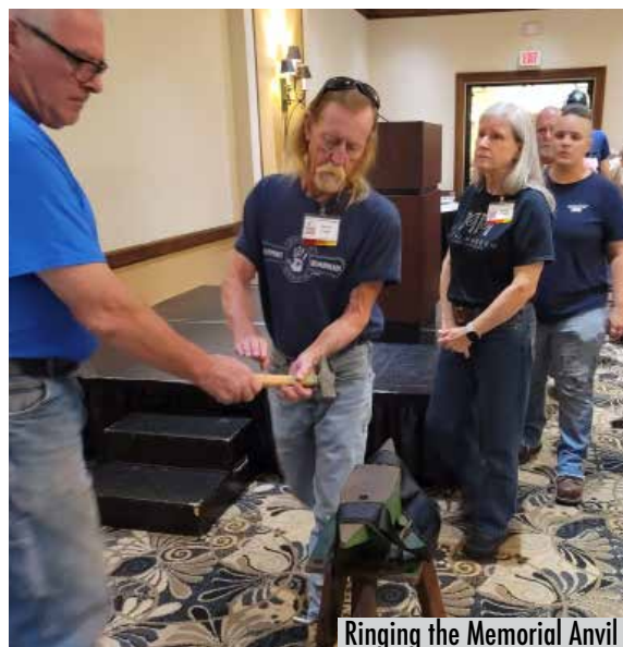
Ringing the Memorial Anvil