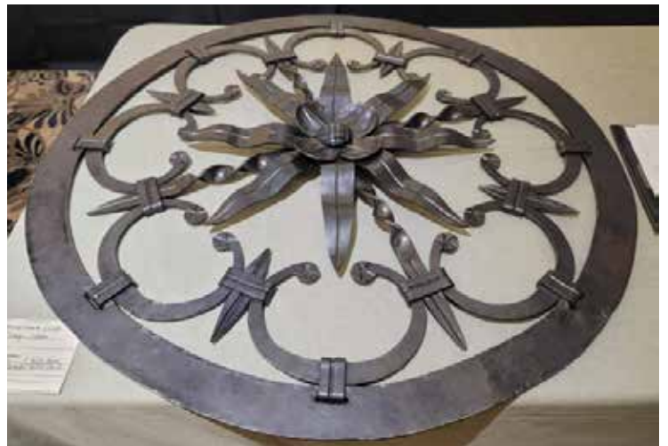
Above: Gallery piece by Craig Hines