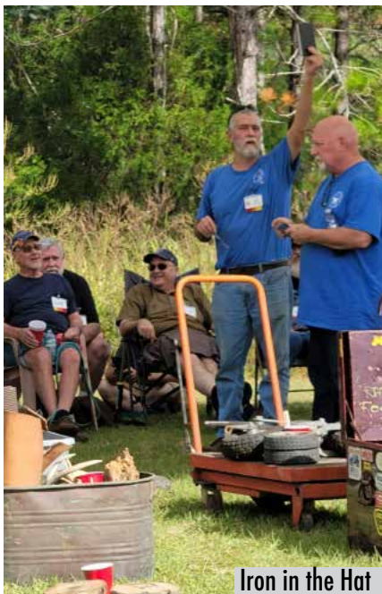
Iron in the Hat