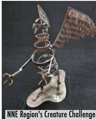
NNE Region's Creature Challenge