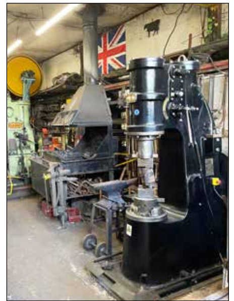
Visiting a UK Master Blacksmith, pages 8-9