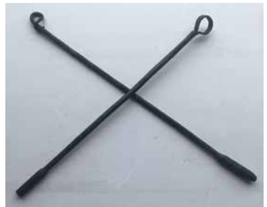
A couple of Loggerheads to draw inspiration from.

you ask? How about making a loggerhead? Sometimes known as a blacksmith's microwave, it's a tool for making your drink hot. Not sure how Timber Creek will judge this one since any hot piece of metal could do the job, but it will probably need to look good enough that you'd be willing to put it in a tankard that you intend to imbibe from.