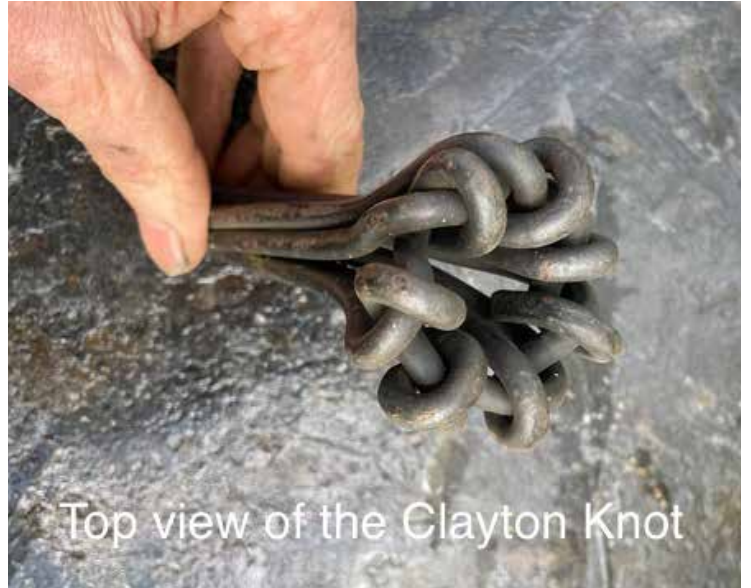
Top view of the Clayton Knot