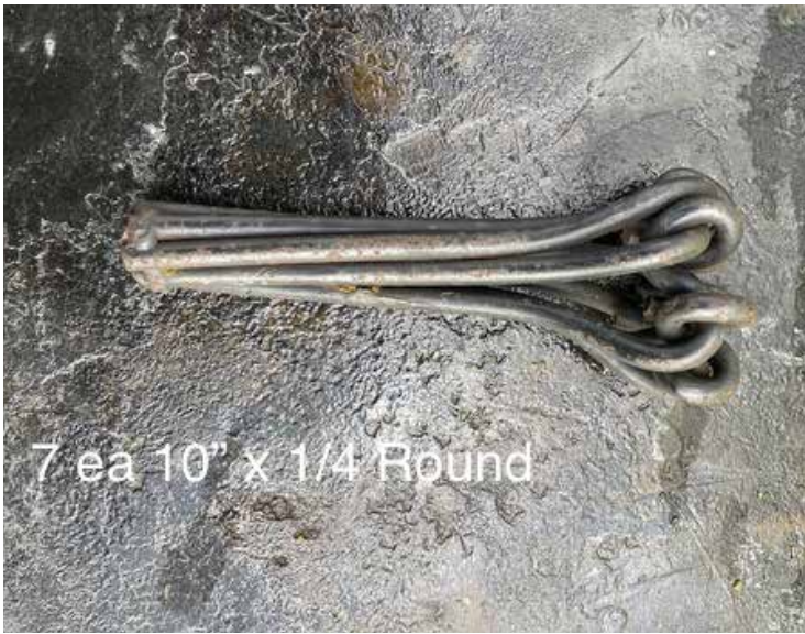
7 ea 10" x 1/4 Round