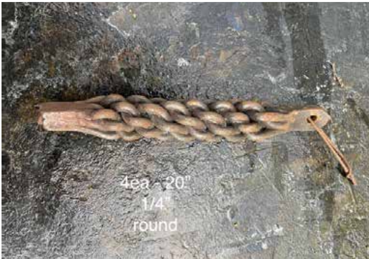
4ea - 20" 1/4" round