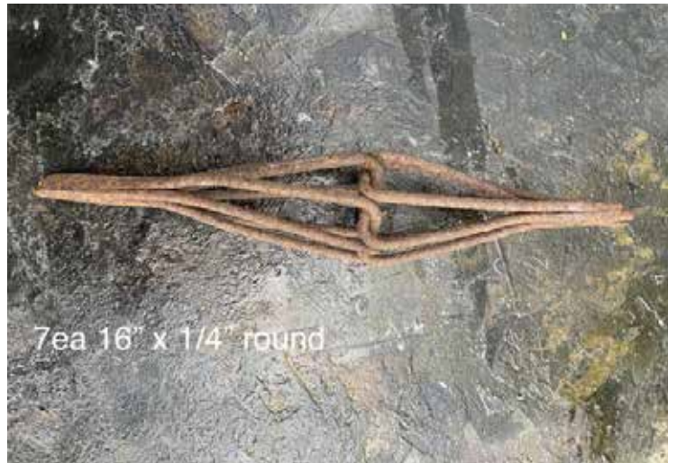
7ea 16" x 1/4" round