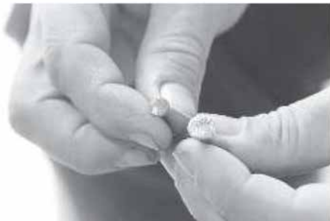
Two bronze rivets with finished, decorated heads.