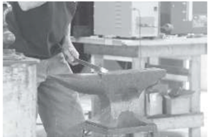
Taper the ends of the bar for the ring.