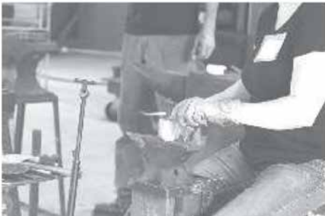
Driving the near-molten end of the bronze rod onto firebrick to start a rivet head.