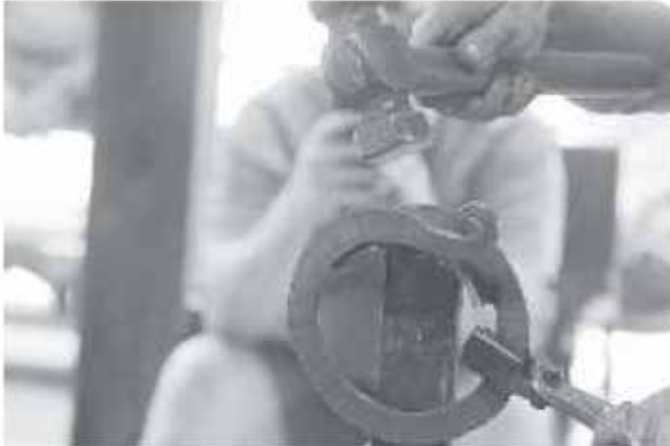
Stake tool for refining the radius of the ring.