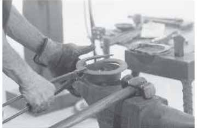
Checking the shape of the ring on a round form.