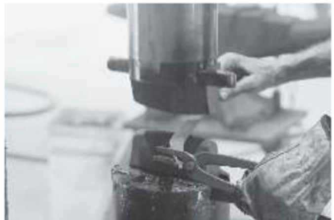
Using fullering dies curved in both directions to fuller one edge of the bar more than the other, causing the bar to bend into a ring.