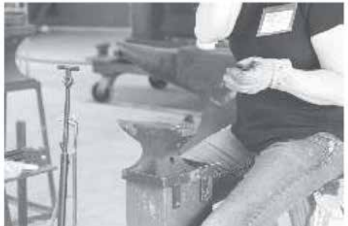
Forging the head of a bronze rivet in a bolster.