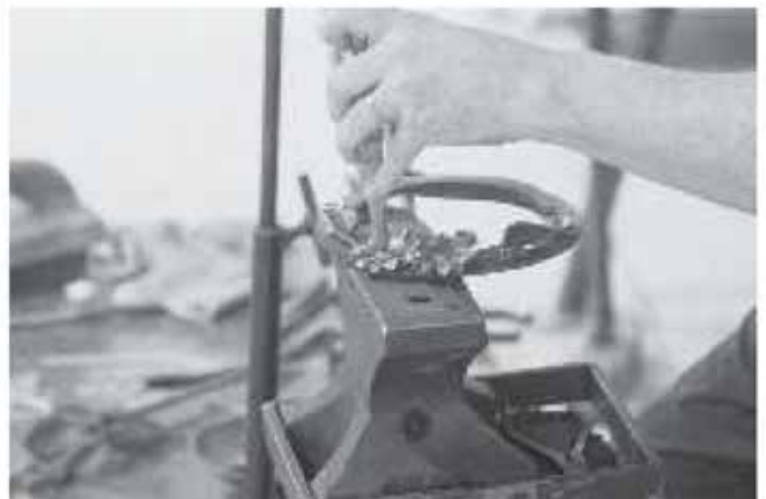
Texturing rivet heads with a punch after setting.

Reprinted from the Bituminous Bits, The Journal of the Alabama Forge Council, November-December 2025