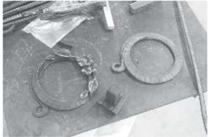
Finished ring with leaves and flowers and a ring before adding the flowers.