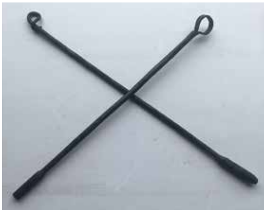
A couple of Loggerheads to draw inspiration from.

Creek Distillery. This year's challenge will be making a loggerhead, sometimes known as a blacksmith's microwave, it's a tool for making your drink hot. Not sure how Timber Creek will judge this one since any hot