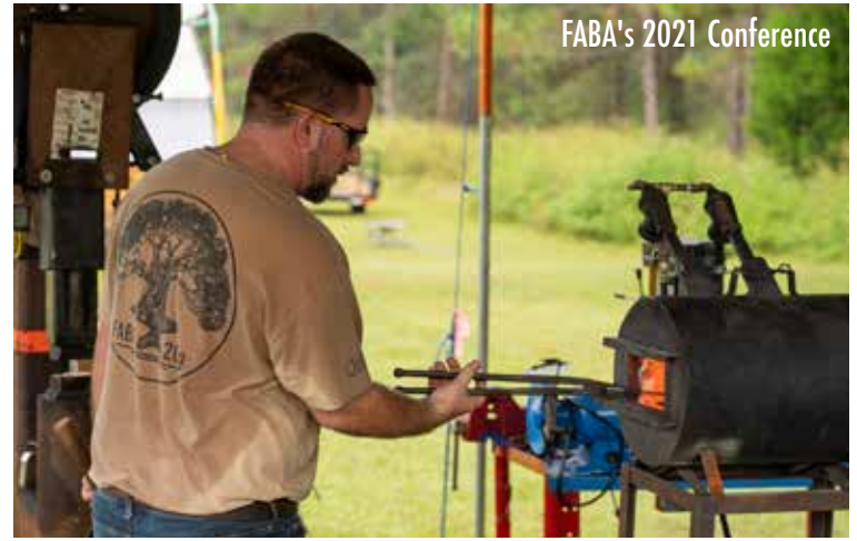
FABA's 2021 Conference