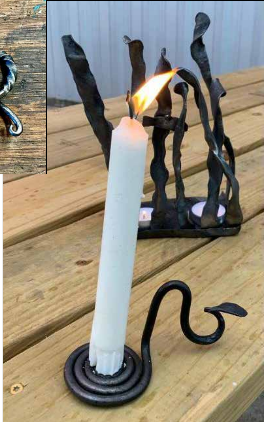
Works produced during the Far West Region's candleholder challenge, pages 6-7.