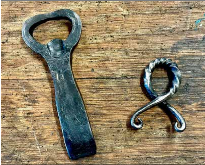
A bottle opener and troll cross from the SE Region, page 4.